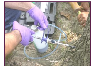
Trunk injection is the most effective treatment for Emerald Ash Borer. The insecticide provides protection for two years.