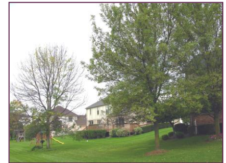
Healthy ash tree protected with insecticide treatments growing next to an untreated Ash Tree killed by EAB.

To be a good candidate for treatment, the Ash Tree must have at least 50% of its crown, meet minimum health standards and be able to absorb treatment.